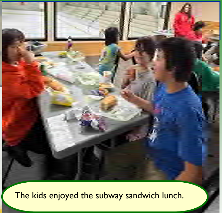
The kids enjoyed the subway sandwich lunch.