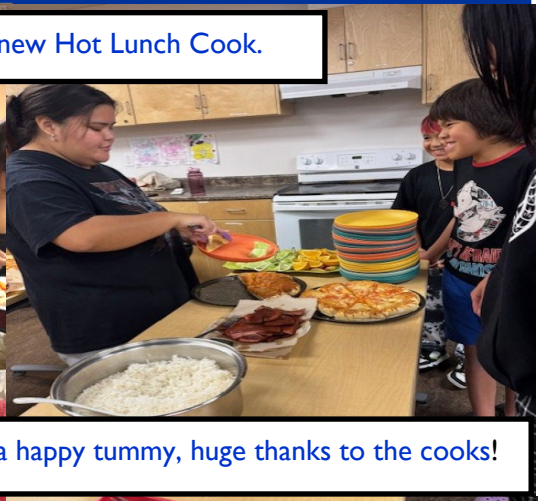
Happy face and a happy tummy, huge thanks to the cooks!