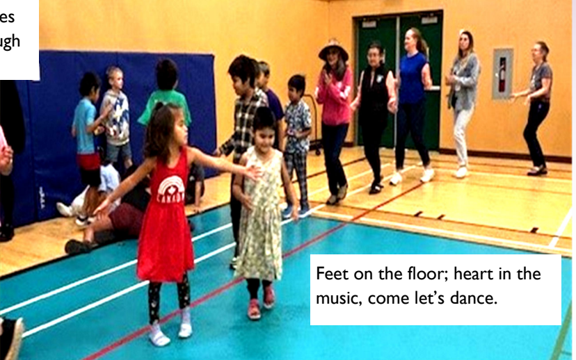
Feet on the floor; heart in the music, come let's dance.