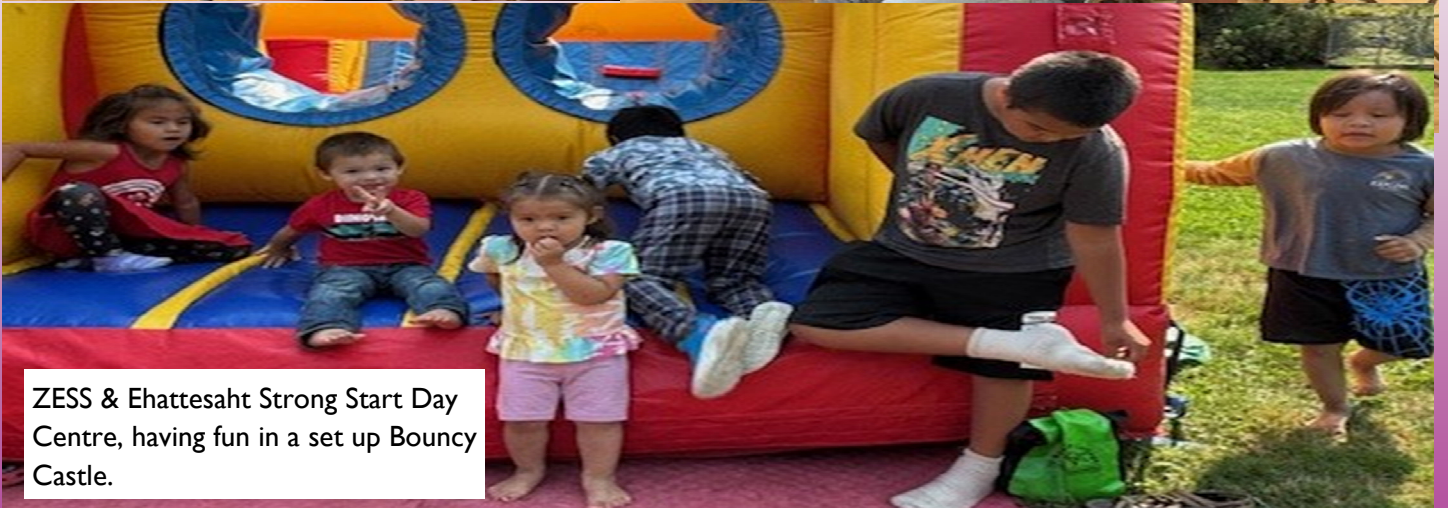
ZESS & Ehattesaht Strong Start Day Centre, having fun in a set up Bouncy Castle.